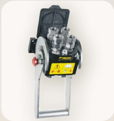
3 Multi-plug plate "ecologic" FASTER