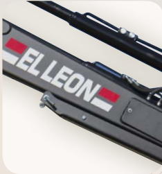
4 Arm integrated support legs