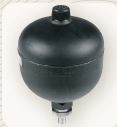
7 Shock absorber (optional)