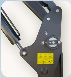
2 Automatic locking system tractor - frontal loader EURO 2.0