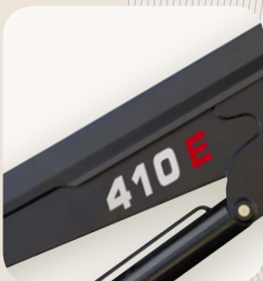
8 Integrated parallelogram system