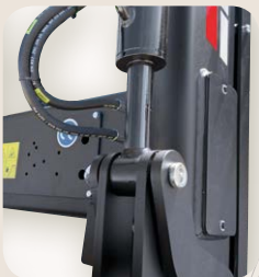
5 Oval reinforced steel tubes