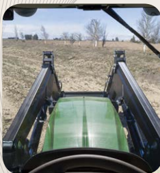
9 Optimum visibility system