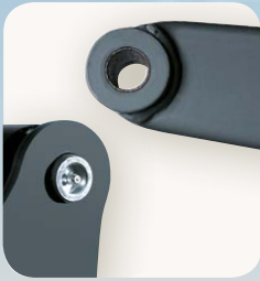
1 Every articulations are bushed and with glidebush