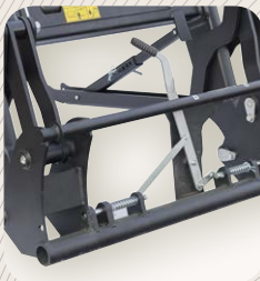
6 Automatic implement coupling "EURO"